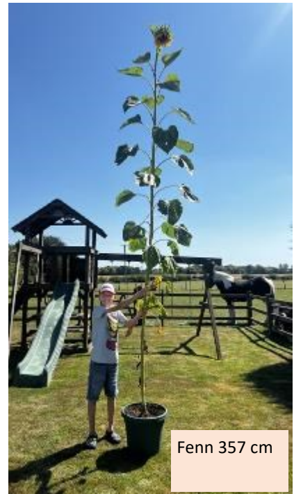
Fenn 357 cm