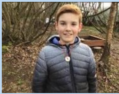
Amazing day at Led by the Wild