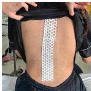
Her dressing in hospital