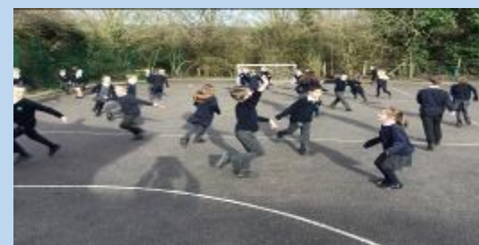
Science in action!