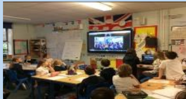
Talking with our partner schools by Zoom