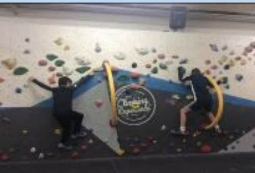
We made it to the Climbing Wall finals!