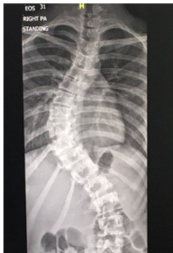
Sophia's x-ray just before surgery