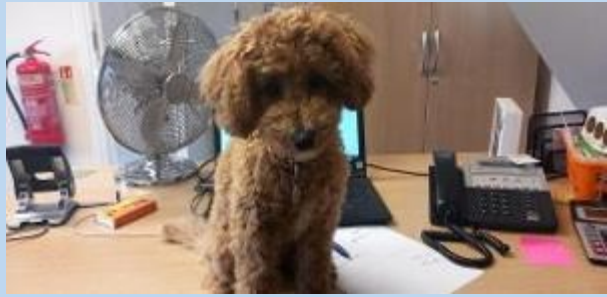
Elsie welcomes everyone to our school!