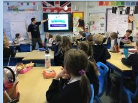
Water cycle workshops!