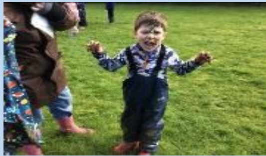
Loving Adventurous Outdoor Learning!