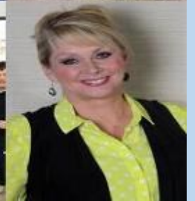
Lots of inspirational visitors and speakers!