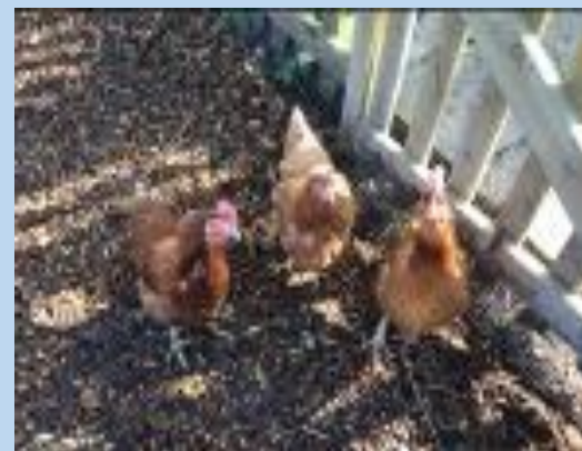
The return of our now healthy looking rescue chickens!