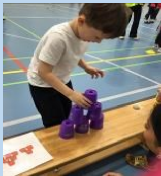
YR Sports Fun Day!