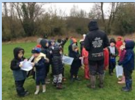
Orienteering with Sports Giants