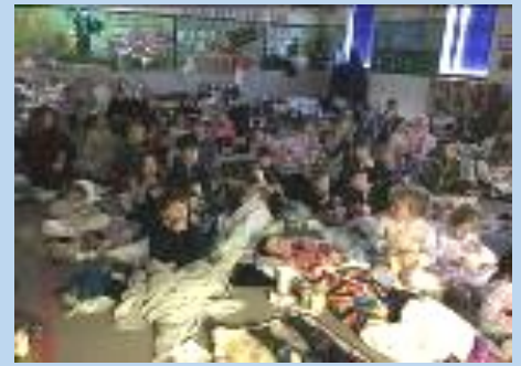
Thank you PTA for our amazing events!