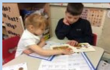
We love our reading buddies!